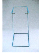
40A Drywall Hopper stand