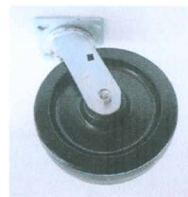
45AS Swivil wheels

McDonald Manufacturing, 17311 Roseton Avenue, Artesia, California 90701 Phone: (562) 924-5404 Fax: (562) 865-3090 sales@mcdmfg.com