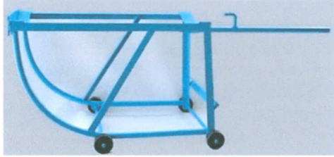
34A All steel welded construction with 3" rubber wheels