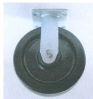
45AR Rigid wheels